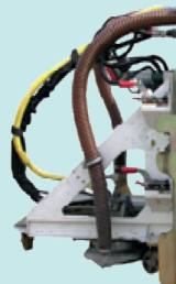
TrackJet® nozzle head