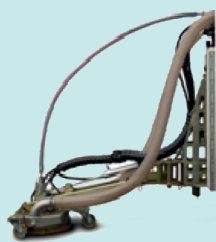
PeelJet® nozzle head